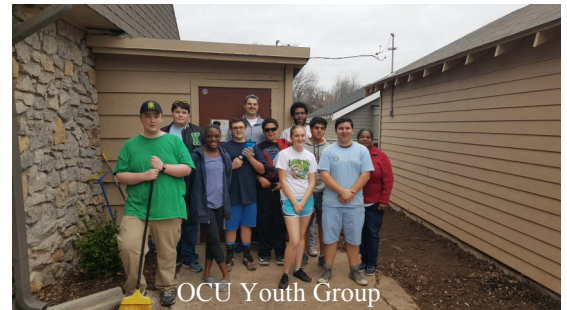
OCU Youth Group