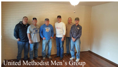
United Methodist Men’s Group